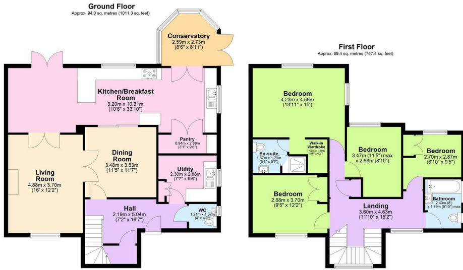
Total area: approx. 163.4 sq. metres (1758.7 sq. feet)